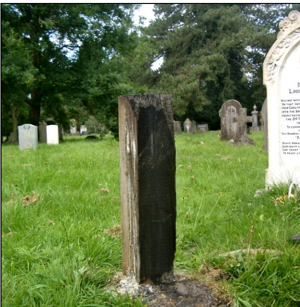
Charred post by Balloon Girl's grave

The warm, dry summer evenings have brought less welcome visitors . Despite the security railings making illicit access dangerous, it is clear that drinking parties are taking place in the cemetery. Generally, the evidence is just the empty cans filling the rubbish bins but, after a recent visit, which had been illuminated by candles, broken glass and other litter was left lying around, candle wax had defaced memorials and a marker post was left badly charred. It is to be hoped that this problem will disappear as the colder, darker nights return.