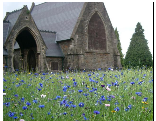
Wild flower garden, blue period

After the initial surge of yellow, the wild flower garden turned predominately blue (mainly cornflower) speckled with a variety of reds, purples and whites, before returning to yellow - but with a marigold type flower now dominating.