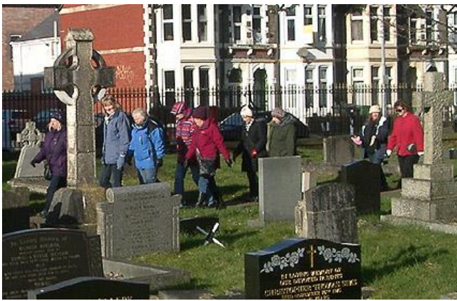
health walkers passing Section D

We meet just inside the gates adjacent to Cathays Library at 10.30 am every Tuesday morning , regardless of the weather. The walks last between 40 minutes and an hour and are taken at a leisurely pace, pausing occasionally for a cemetery related anecdote. With an emphasis on sociability, everyone is welcome both on the walk and, afterwards, when we adjourn to a cosy local café for a chat over tea or coffee. You don't need to book or come regularly - all you have to do is turn up: we look forward to seeing you.