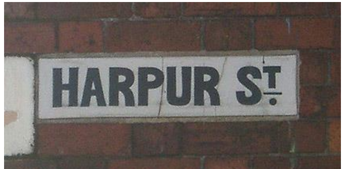
Harpur Street nameplate

This red and yellow brick building originally housed pumps, driven by huge beam engines, to help sewage from the western side of Cardiff on its way to eventual discharge to the Severn Estuary off Lavernock Point. If you head out from the city centre for this building, look out for Harpur Street on the right of Penarth Road, just after the entrance to Brains Brewery.