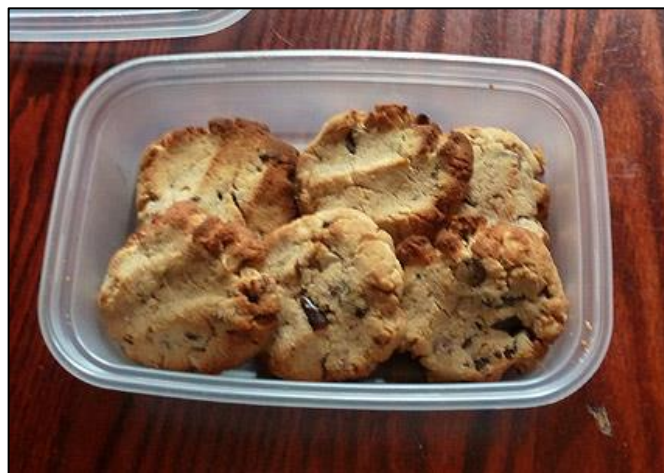
The thank you biscuits

Later the same day a young man, with his mother bending his ear on the importance of looking after his property, collected his laptop - a happy ending. On the following week's walk, which by chance passed the same point, a small plastic take-away box was sitting on a piece of paper on the top of a post. The piece of paper was a thank you note and the box contained some homemade biscuits, that went down well with our usual post walk refreshments - an even happier ending!