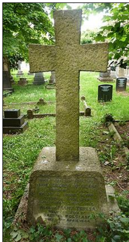
Polglase family memorial