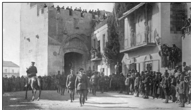
General Allenby entering Jerusalem - archive picture

trenches. With Beersheba secured, the EEF commenced the Third Battle of Gaza, which was taken by 7 th November, aided by a strategic withdrawal by the Turks. With Gaza taken, the road to Jerusalem lay before them but, although knocked back, the Turks fought fiercely as they withdrew. In pursuit, Allenby's men moved in two directions. One thrust pushed along the coast towards Jaffa which was taken on 16 th November. Another was directed inland at Jerusalem. Acutely conscious of the need to avoid bringing Jerusalem under fire, Allenby planned to encircle the city and cut off the Turkish garrison. The first attempt to do this at the end of November failed. But Allenby repositioned his troops and on the night of 7 th December he struck again. Believing that the withdrawal of their forward positions was the start of a general retreat, the Turks moved out of the city and relinquished Jerusalem with little resistance. After the final capture of the Mount of Olives, the city fell. Conscious of the city's special meaning for three of the world's great religions, in a deliberate act of humility and respect Allenby entered Jerusalem on foot through the Jaffa Gate on 11 th December.