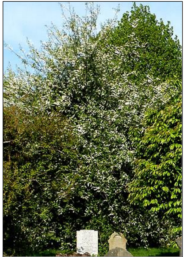
Prunus padus watereri

grandiflora , because of its spectacular spring display of 20cm long spikes of small fragrant flowers. These blooms are slender racemes made from many small star-shaped flowers, with white petals and yellow centres, that are so abundant that their weight causes the branches to droop downwards. The blooms carry an almond scent that is irresistible to bees and butterflies ... and most people, too. Small black fruits that are inedible but attractive to birds appear in summer.