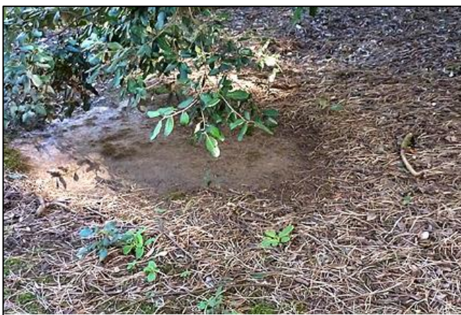
The swept circle

It has been a spring of varied weather - a wet March, a dry and warmer than average April and a cool, but dry, May. But there have been windy spells, too. One of the latter produced a strange effect in the communal Nazareth House plot in Section D. While most of the area was covered in fallen leaves and other small tree debris, one near circular patch was completely clear. A drooping leafy branch of a nearby tree had responded to the high winds with a circular sweeping motion, creating the unusual phenomenon.