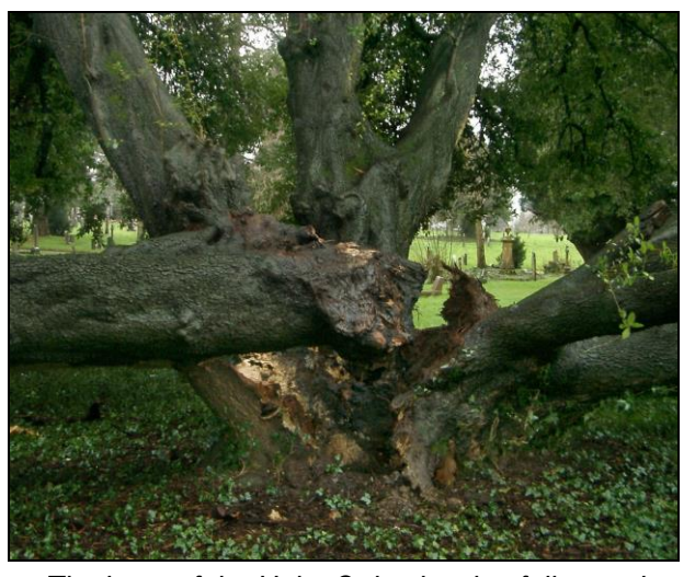
The base of the Holm Oak, showing fallen and remaining trunks: