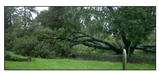
One of the fallen trunks

The holm oak is, of course, an evergreen, so readily collected a heavy load of snow and the whole problem was compounded by the fact that, with multiple trunks, all the development on any one was on one side only. This tree almost certainly dated from the very first days of the Cemetery, so it is perhaps a miracle that it had lasted so long. Anyway, as a result of the snow, two thirds of the huge trunks came down, splaying out to cover a similar portion of a circle about 100 feet (30 metres) in diameter. On inspection, it was concluded that the remaining trunks were also unsafe. Bereavement Services have acted with commendable speed and efficiency: within a few weeks, the fallen trunks had been cut up and stacked, to be followed by the careful felling of the remaining dangerous trunks.