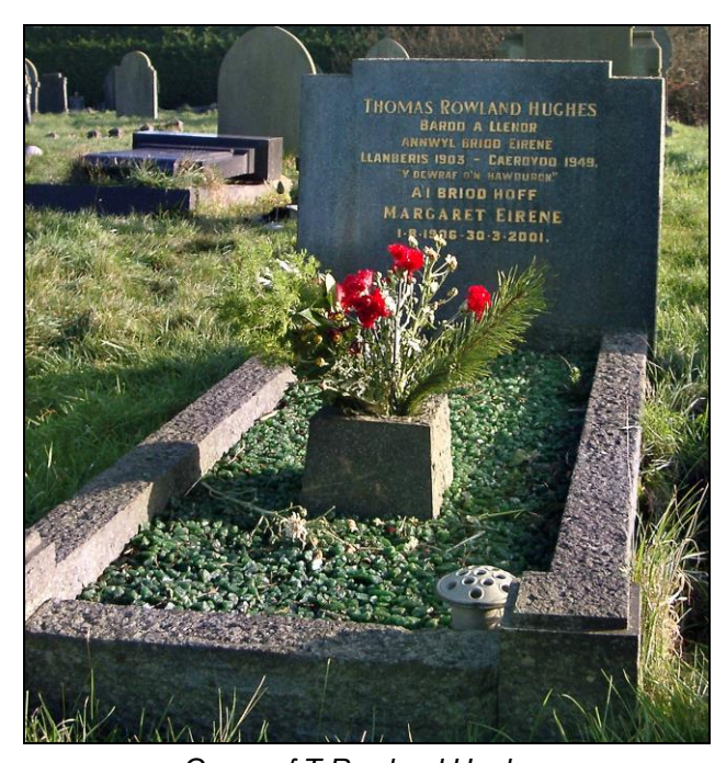
Grave of T Rowland Hughes

Those who went on the guided walk in the "new" part of the cemetery in September 2011 were treated to a musical interlude - a recording by a Welsh male voice choir singing Tydi a roddaist (Thou Gavest). The song was played beside the grave of its author, T. Rowland Hughes: his poem had been set to music by Arwel Hughes in 1938.