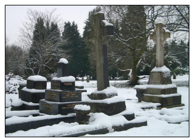
Gravestones trimmed with snow

The January snow arrived with its usual chaos, but there is no doubt that the Cemetery can look enchanting when it is clothed in white, although you have to be quick to catch it at its best.