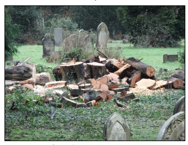
One of the larger log piles

As if to show that the Cemetery can take all this in its stride, the first crocuses appeared within a week of the snow disappearing.