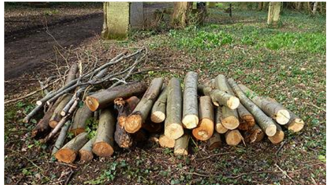
Log pile in Section H

In Section H, four of the multiple trunks of a once coppiced ash fell, blocking a path, but these were quickly converted to log piles by Bereavement Services.