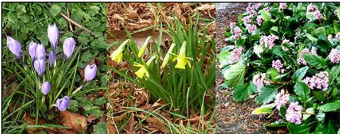
Purple crocus, dwarf daffodils and bergenia

As we have noted in previous issues, in the first half of February, the primroses are joined by celandine, snowdrop, daffodil and crocus, and the first blossom, on the bird cherry, joins in. The bergenia (elephant ears) under the cedar of Lebanon seem to be at their best when the days are shortest. With few frosts and little sign of snow, it does appear that winter is being squeezed out of the seasonal calendar.