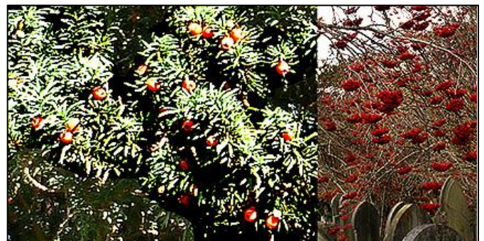
Yew and rowan berries

But other shrubs and trees have done just as well. There were lots of rose hips and rowan berries and the fruit of the yews has been less sparse than usual. The birds are quick to consume the rowan berries, but appear to be discerning, hence the example shown below was left until the end despite the abundance of fruit bending the branches down.