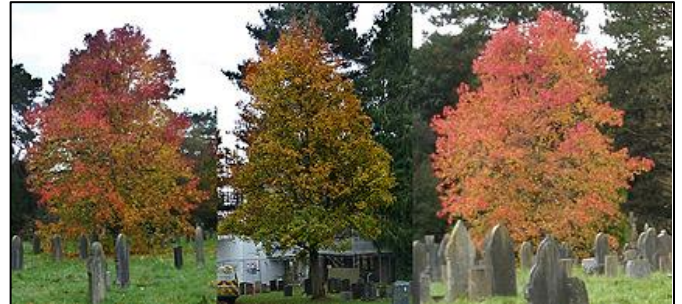
Autumn colours of early liquidamber, ornamental pear & later liquidamber

Later we enjoyed the ornamental pear and the liquidamber. In the images below there are early and late versions of the latter.