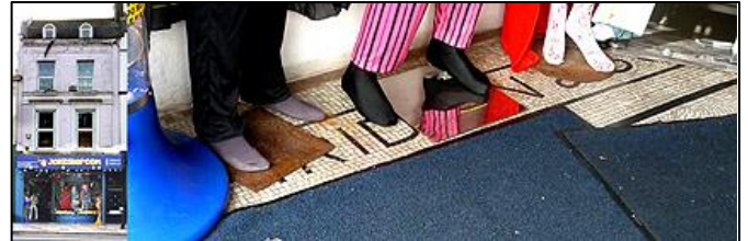
Mosaic floor at 9 Duke Street