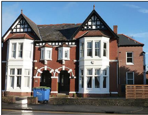
12 North Road